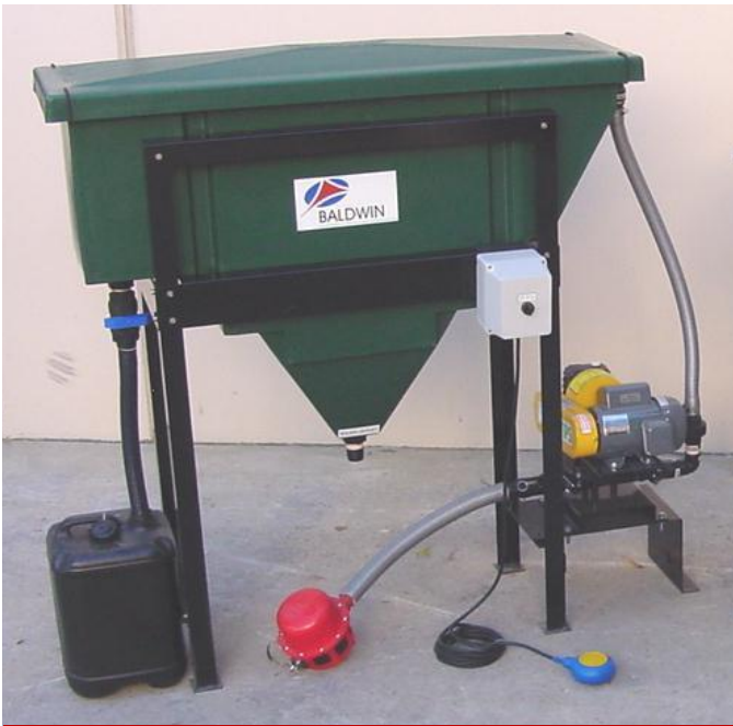
MPV-12 CPS with pump, pump stand & waste oil tank