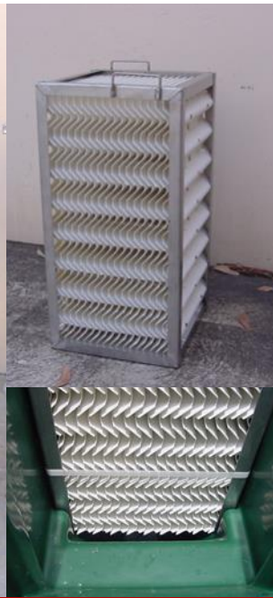
Plate Pack detail